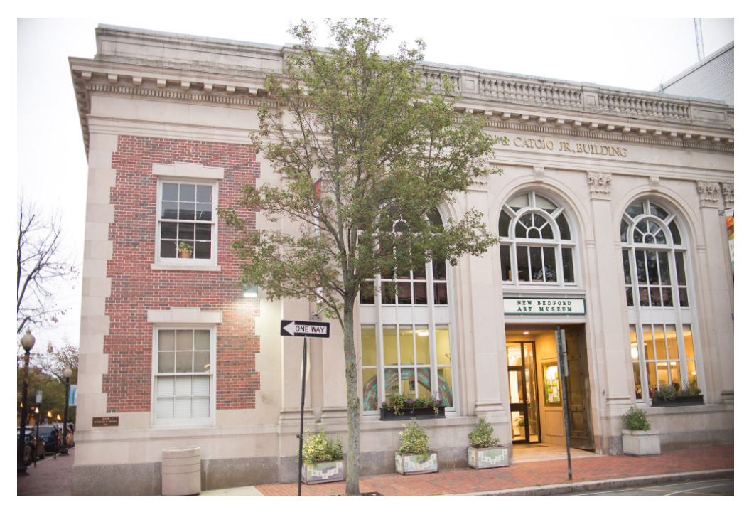
New Bedford Art Museum