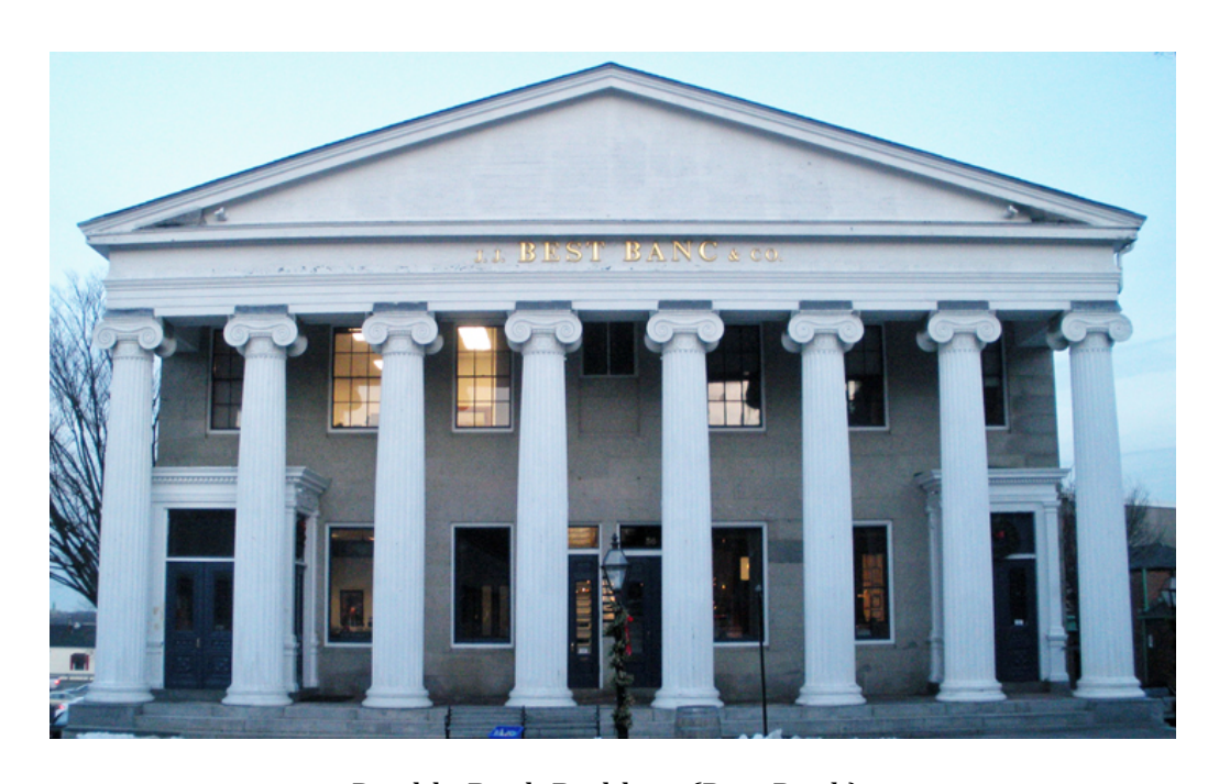
Double Bank Building (Best Bank)